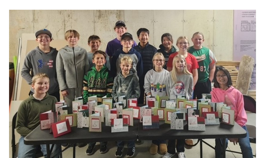
No Limits 4-H Club Christmas Cards for Veterans.

No Limits 4-H Club Salvation Army Bell Ringing.