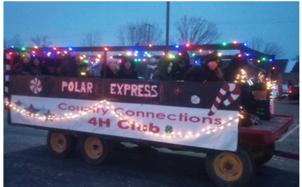
Country Connections 4-H Club participated in the Capac Lighted Christmas Parade.

If you would like your club activities highlighted in the monthly 4-H Newsletter, send photos and a short description to warchuc1@msu.edu